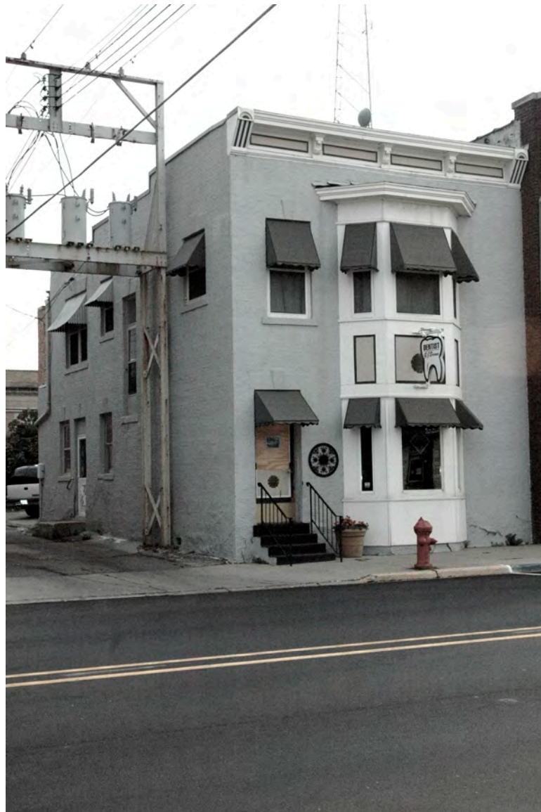
Looking north across First Avenue East, this photo shows how the current occupant has used paint and non-historic awnings to emphasize the architectural details of the building.