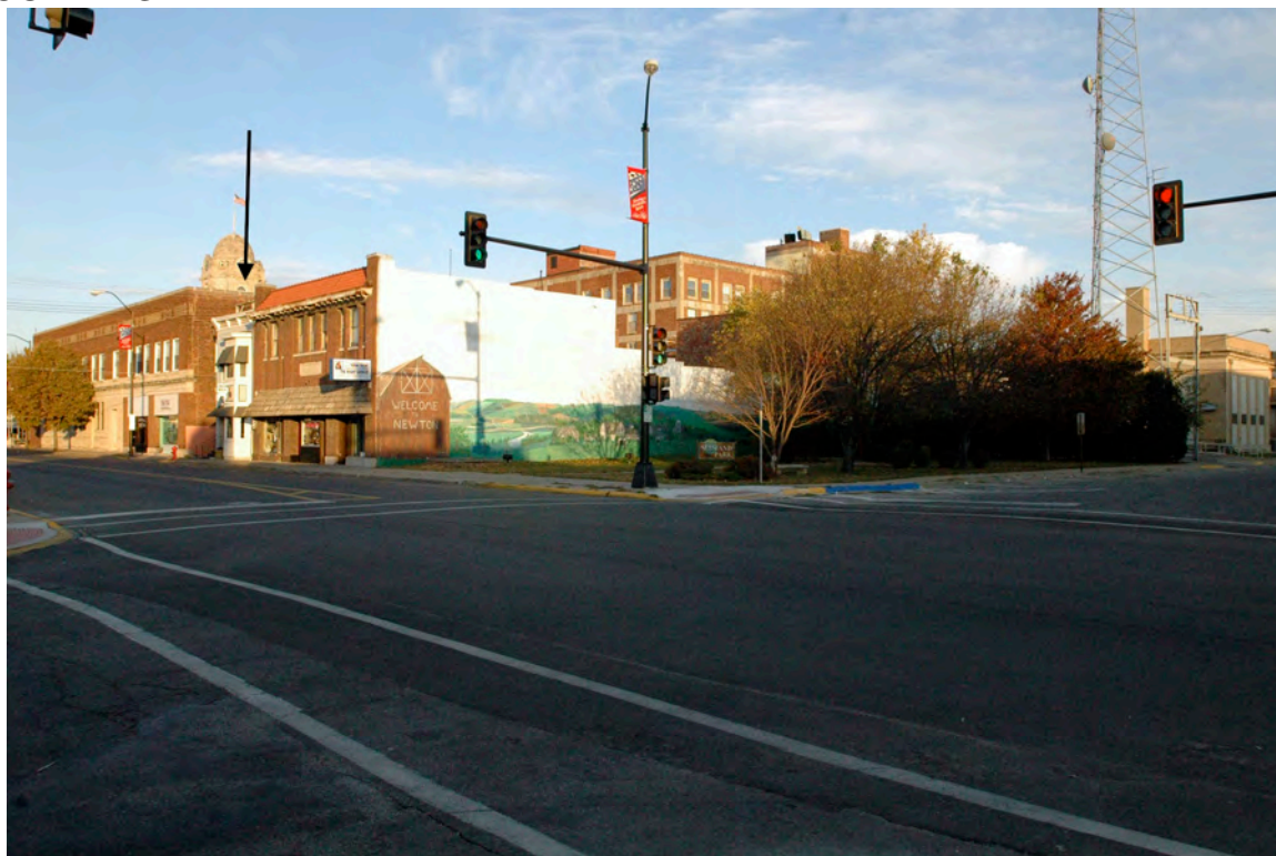
View of the north side of the 100 block of 1 Ave E, looking northwest from the corner of First Avenue East and East Second Street. The location of the resource is indicated by an arrow.”