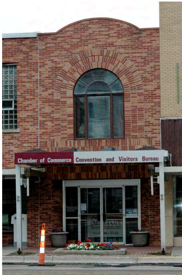
View of the building façade (north) looking south across 1 st Ave. W.