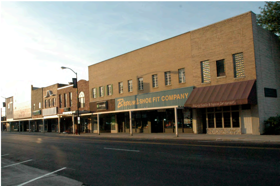
View of the south side of the 100 block of 1 Ave W, looking southeast. The location of the building is indicated.

(All images by Sue Smith, June 30, 2011)