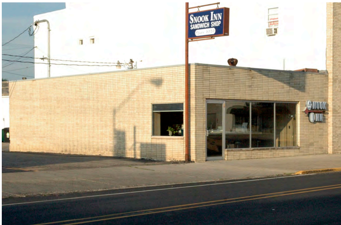
View of the resource, looking southwest across 1 st Ave. W.