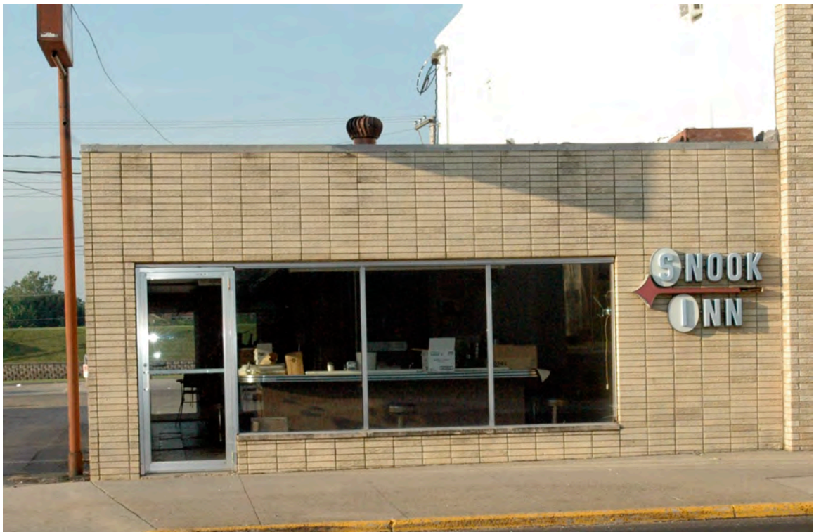
View of the resource, looking south across 1 st Ave. W.