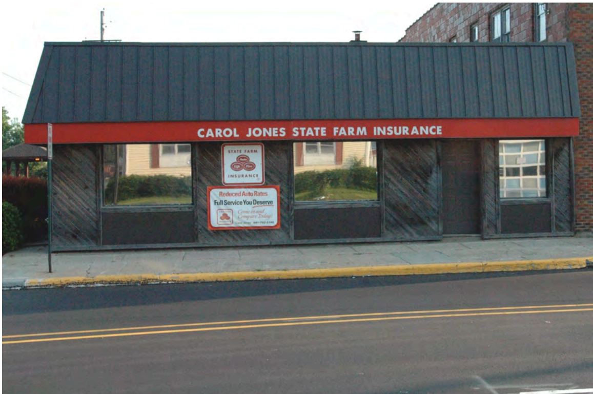
View of the resource, looking north across 1 st Ave. W.