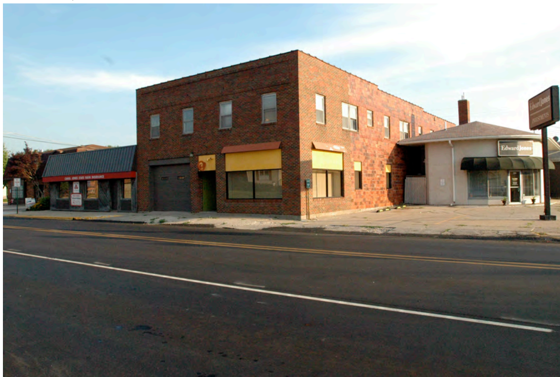
View of the north side of the 300 block of 1st Ave. W., looking northwest. The location of the building is indicated.

(June 30, 2011)